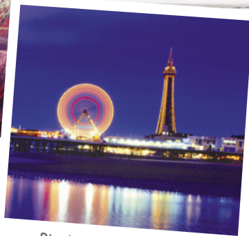
Blackpool Illuminations switch on