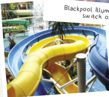
Sandcastle Waterpark, Blackpool