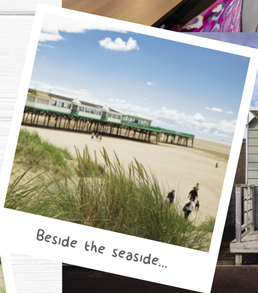
Beside the seaside...