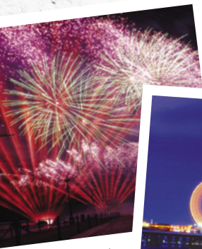
World Fireworks Championship

Take a look at some of the events going on locally throughout the year.