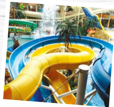
Sandcastle Waterpark, Blackpool