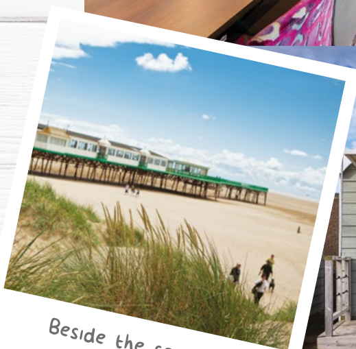
Beside the seaside...