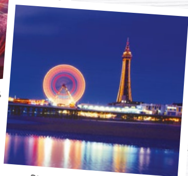
Blackpool Illuminations switch on