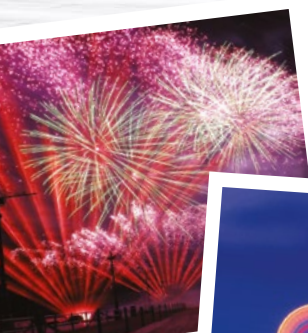
World Fireworks Championship

Take a look at some of the events going on locally throughout the year.